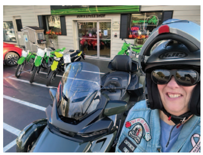
Waiting at Don's to see who might show up for an impromptu ride.