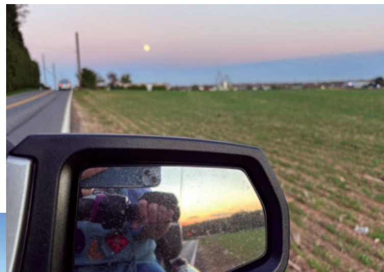
Saying hello to the moon "somewhere" in Lancaster County